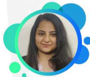
Vrata Dua Article Trainee (Execution)