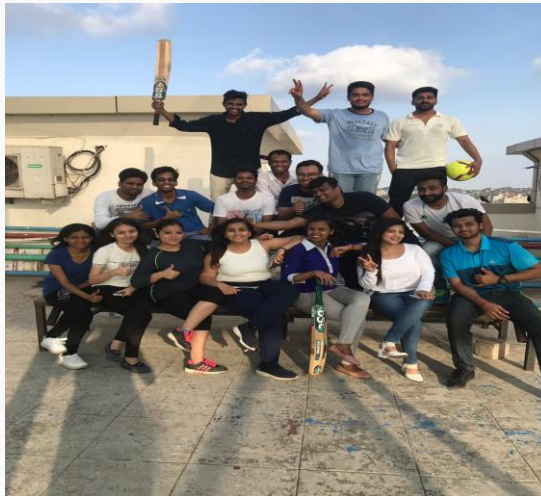
Together we stand